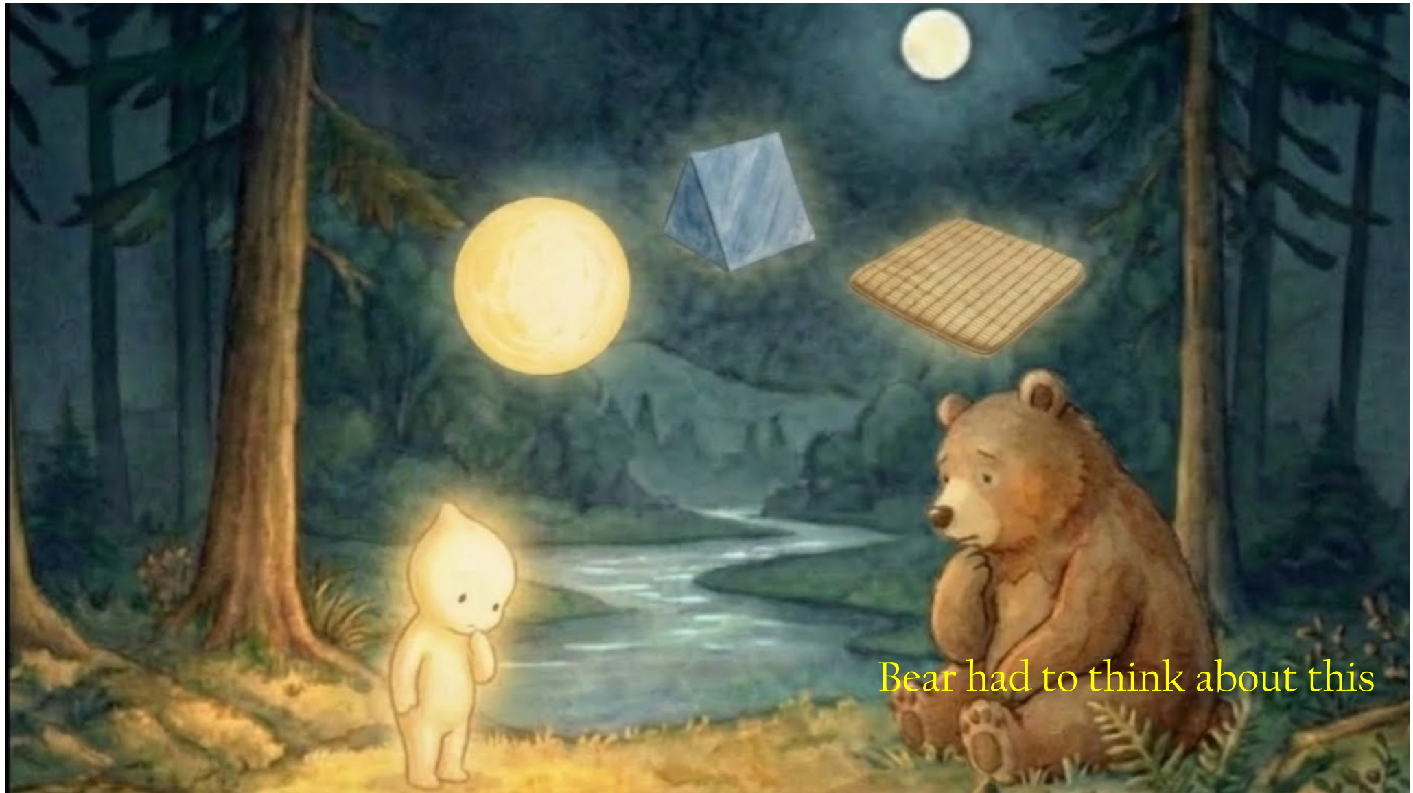
Bear had to think about this